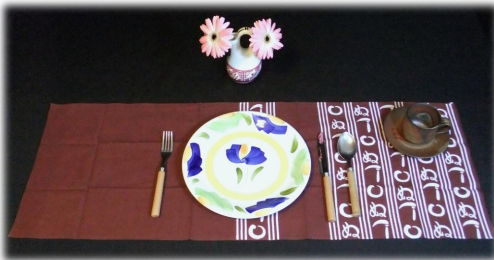
Kamawanu (don't mind)