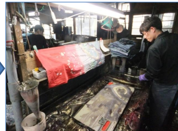
Pour color dye

Chu-sen dyeing process – everything handmade!