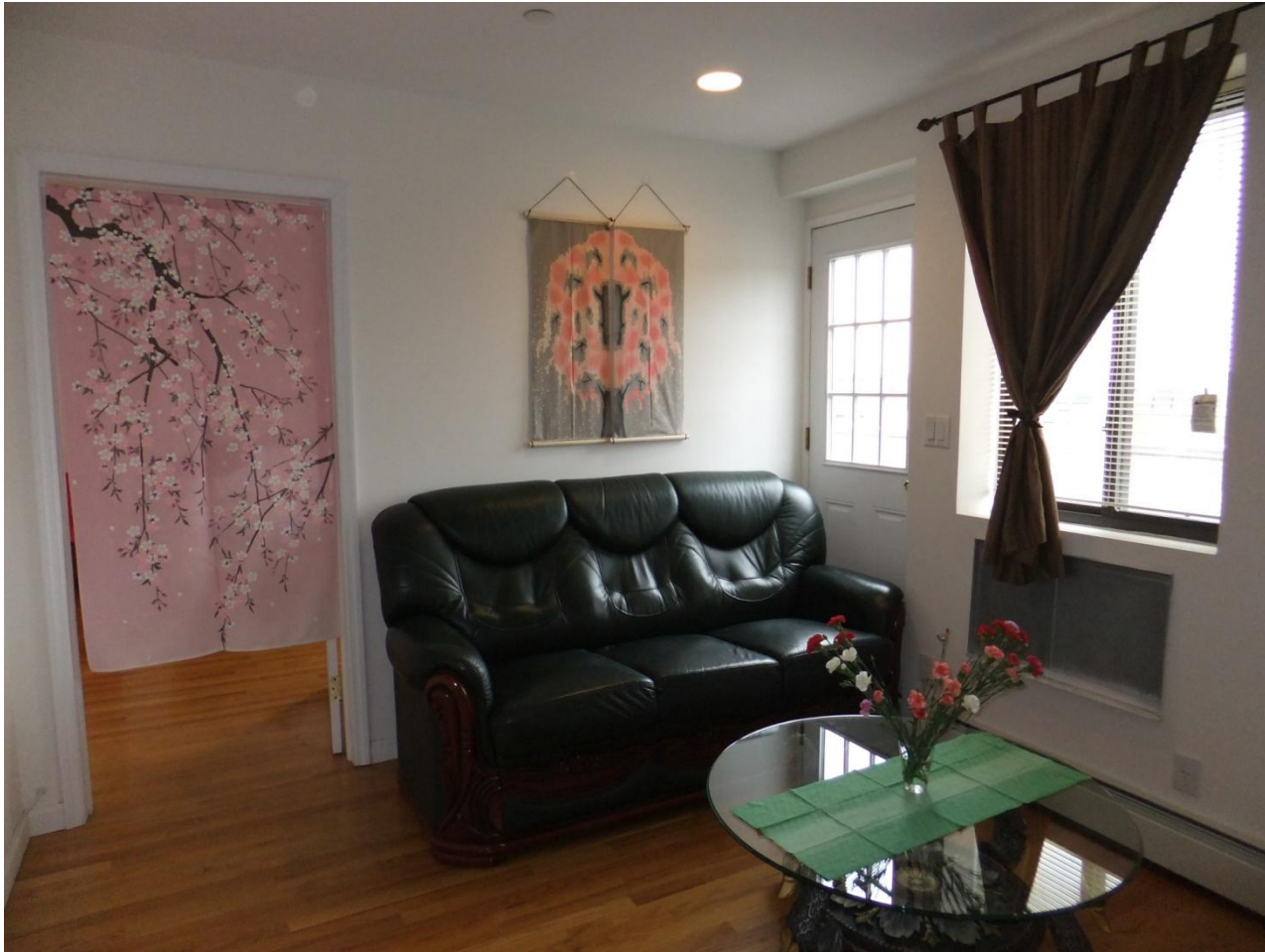
The doorway hanging is a noren curtain.