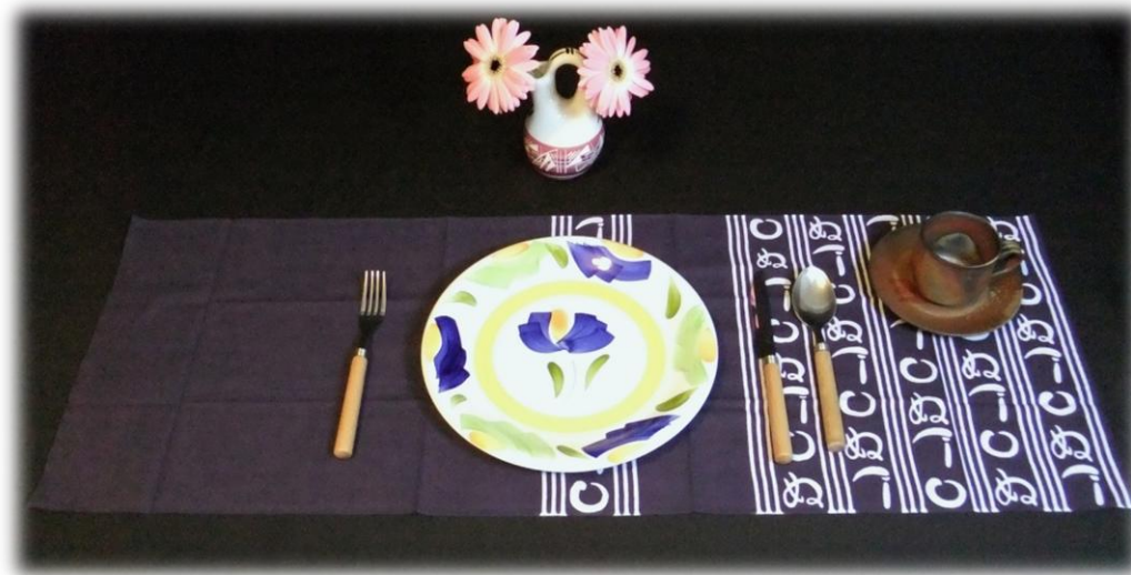
Kamawanu (don't mind)