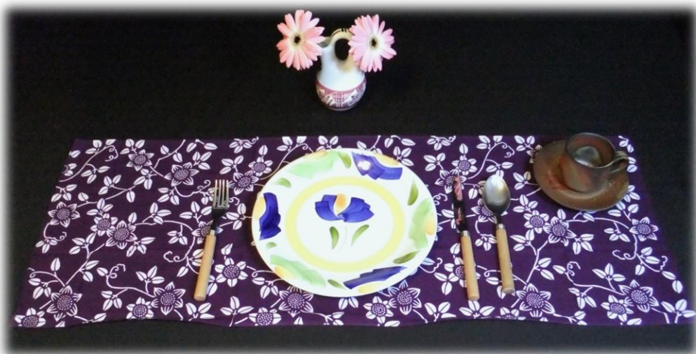
Clematis (purple back)