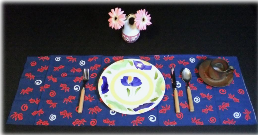
Goldfishes (blue back)