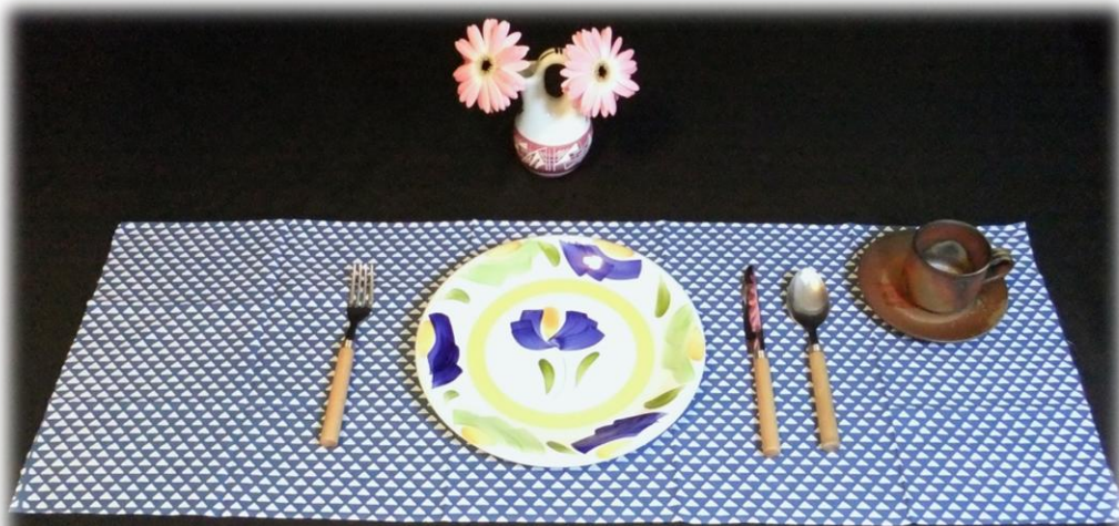
Fish scales (blue)