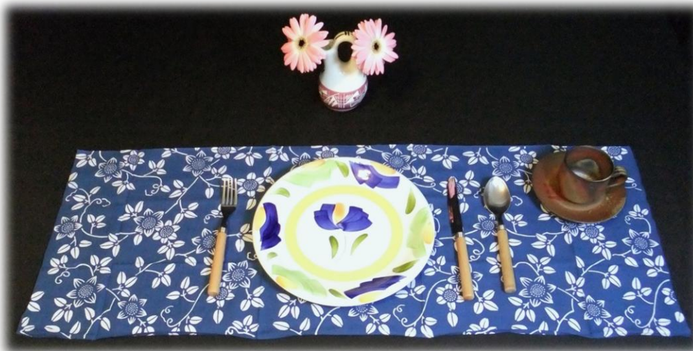
Clematis (blue back)