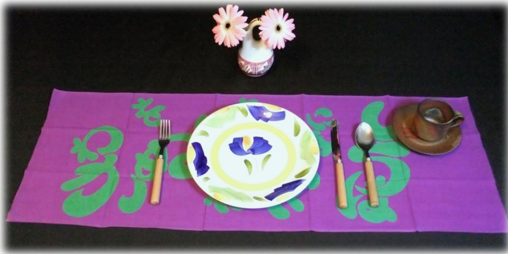
Japanese letters (purple pink)