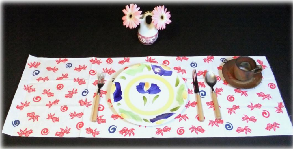
Goldfishes (white back)