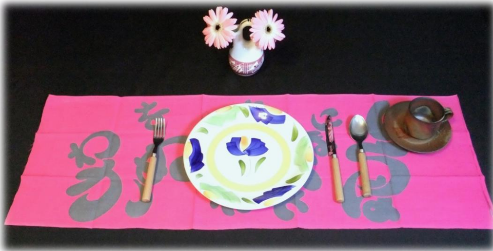
Japanese letters (pink back)