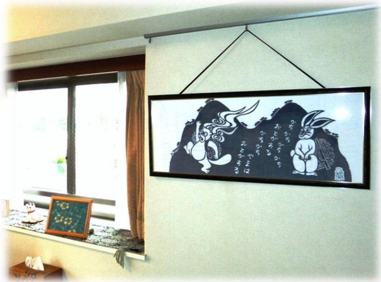
Japanese folk tale