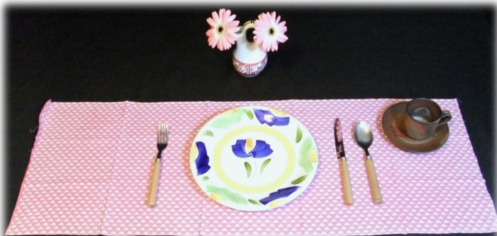
Fish scales (pink)