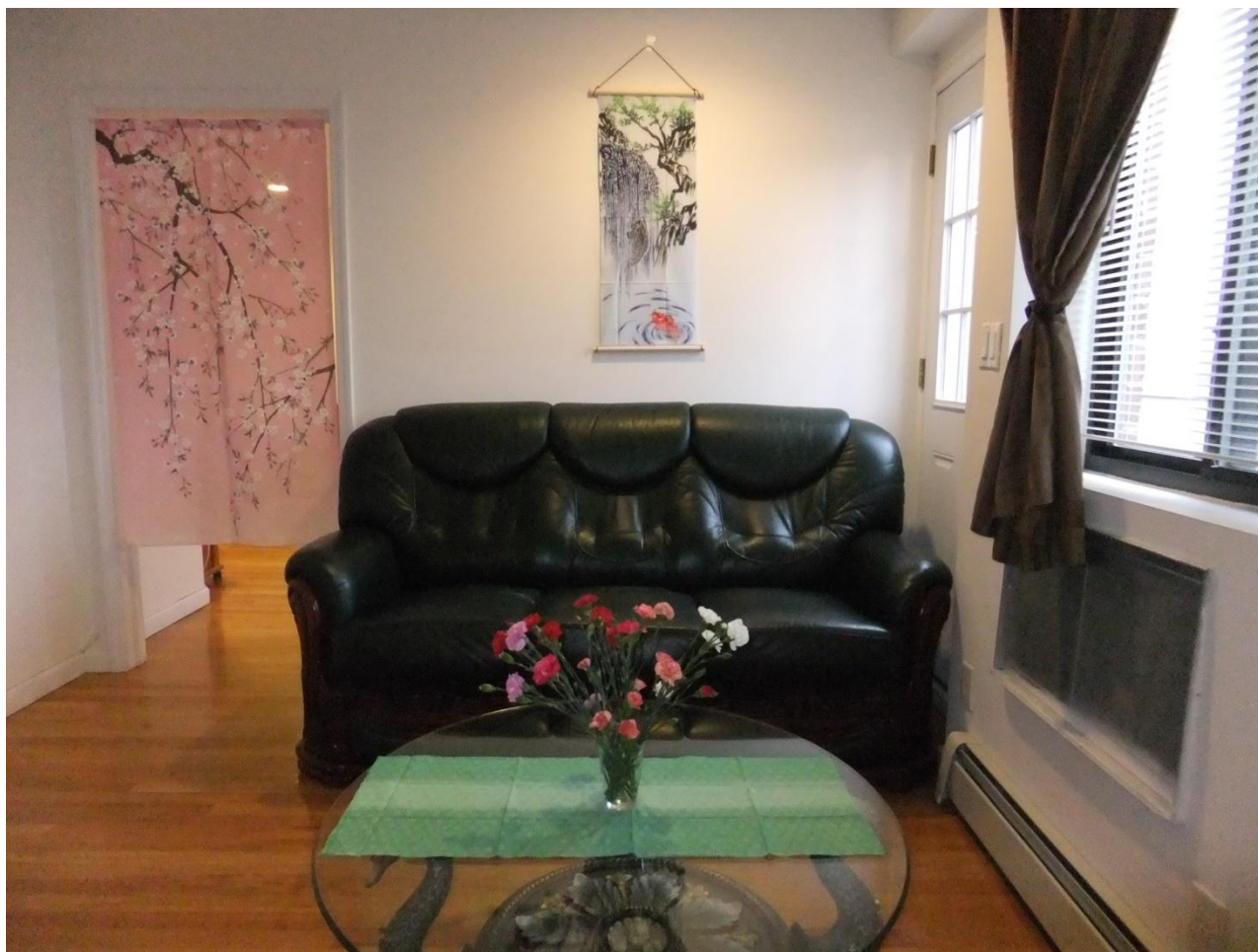
The doorway hanging is a noren curtain.