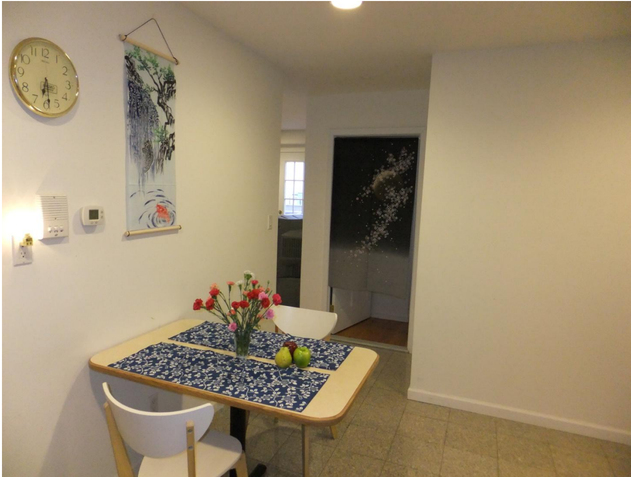
The doorway hanging is a noren curtain.